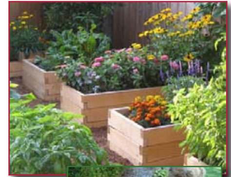
*First photo courtesy of Naturallyards

We certainly welcome other monetary donations and volunteer efforts. We will be recognizing people making these important donations as Friends of the Garden.